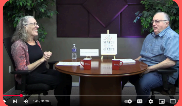
"A Journey Into Ireland's Giants: Myth Meets Science in Local Author's Book" YouTube interview, Royal Examiner, Nov. 22, 2024

https://www.youtube.com/watch?v=wF1lfWyK6Ush