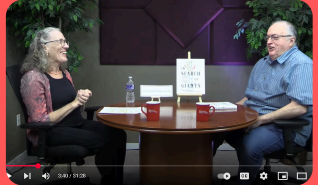
"A Journey Into Ireland's Giants: Myth Meets Science in Local Author's Book" YouTube interview, Royal Examiner, Nov. 22, 2024

https://www.youtube.com/watch?v=wF1lfWyK6Ush